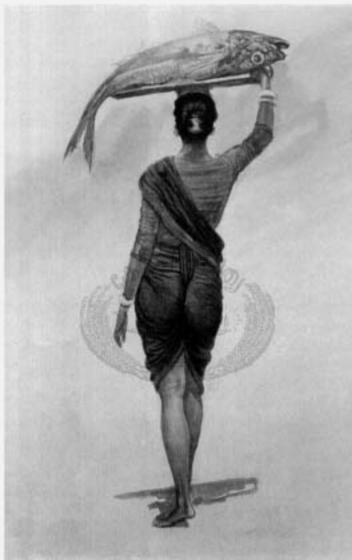
A FISHWIFE OF BOMBAY